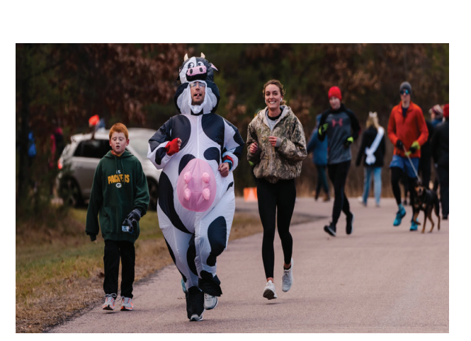
More photos, courtesy of Chelsea Willard Photography, may be viewed on D.R.A.F.T.'s website at draftromewi.com.